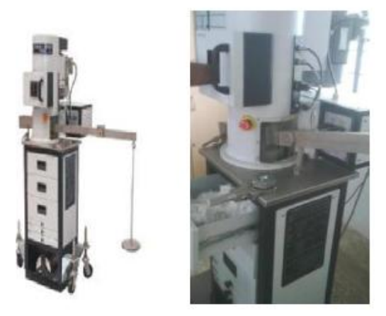
Fig.1 Four Ball Tester

The Ducom four ball testers is widely accepted as the industry standard for conducting EP, AW property test of lubricants. The Ducom four ball testers has the unique capability of evaluating lubricants for their wear preventive, extreme pressure frictional properties and shear stability properties, all in one machine. The test system is capable of carrying out a number of standards applicable to lubricant characterization and its capabilities extend beyond the scope of these standards, allowing users to perform a variety of customized tests. This instrument uses four balls, three at the bottom and one on top. The bottom three balls are held firmly in a ball pot containing the lubricant under test and pressed against the test ball. The top ball is made to rotate at the desired speed wile the bottom three balls are pressed against it. The lubricant under test is characterized by evaluating the wear scar formed on the balls after the test and evaluating the load at which the lubricant fails and the four balls weld together.